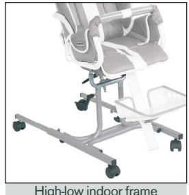
High-low indoor frame