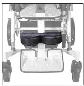
Calf rest COMFORT