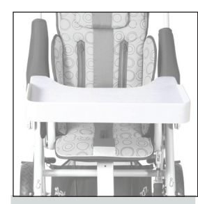
Work board CLASSIC