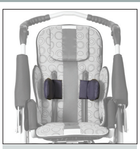
Side trunkrest CLASSIC