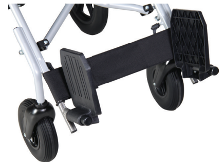
2-piece BASIC foldable footrest